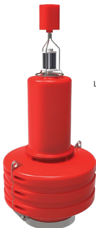
Gannet 1500 Navigation Buoys Port & Starboard Lateral Hand Marks (Region A)

* Larger focal heights available on request. Contact JFC for further details.