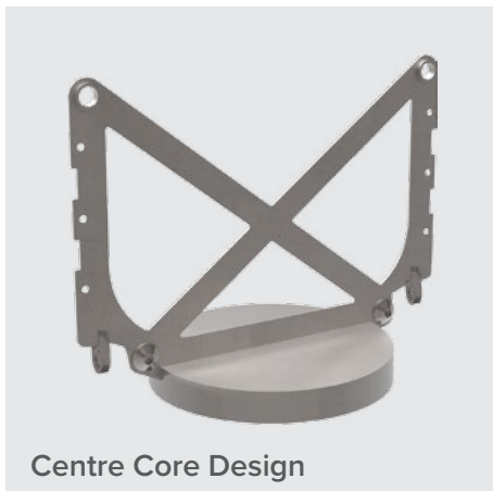
Centre Core Design